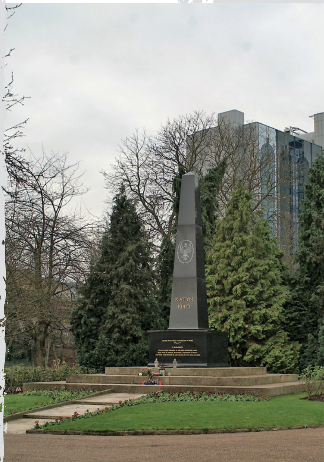
Monument at Gunnersbury Cemetery in London