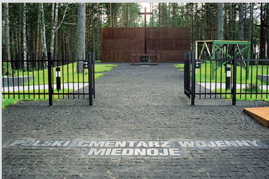
Polish War Cemetery in Mednoje