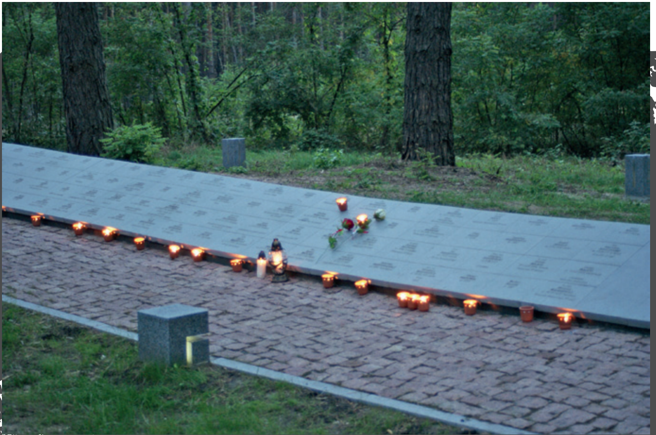
Polish War Cemetery in Kiev-Bykivnia