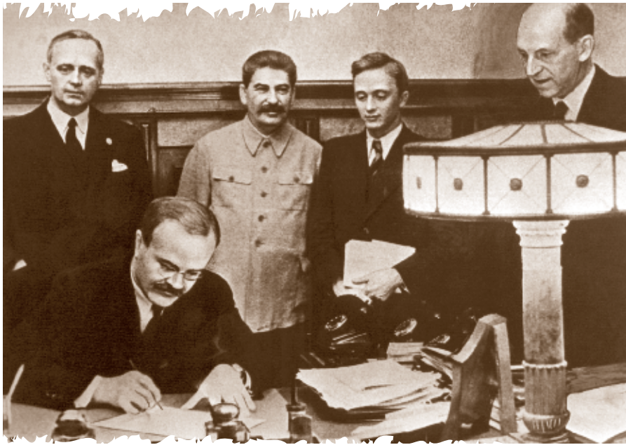
Signing of the Molotov-Ribbentrop Pact

political parties, social organizations, etc. Officers were also subjected to massive ideological pressure; it was intended, as we can assume, to transform them into supporters of communism and Soviet authority. This action ended in a fiasco. The prisoners of war – with few exceptions – remained loyal to Poland and absolutely convinced that the Republic would be reborn and the occupiers would be defeated.