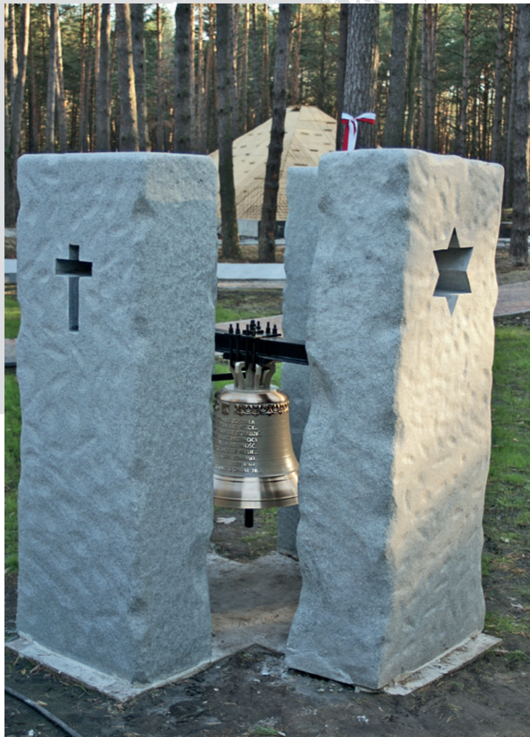
Polish War Cemetery in Kiev-Bykivnia