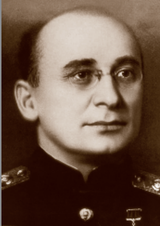
Head of NKVD Lavrenti Beria

earlier plans: all prisoners – 14,700 of them – were to be executed. Moreover, Beria proposed to kill 11,000 Polish citizens arrested by the NKVD and imprisoned in USSR-occupied Polish territories.