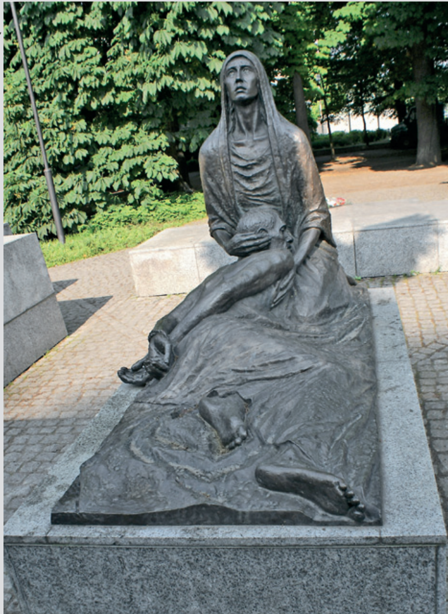
Monument to the Victims of the Katyn Massacre, Juliusz Słowacki Park in Wrocław