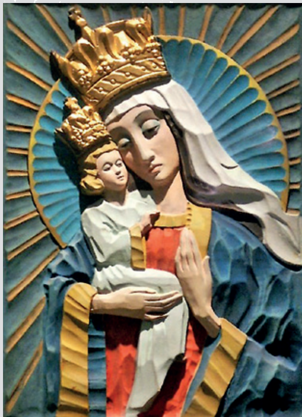
Chapel in the right nave of St. Andrew Bobola Church in London