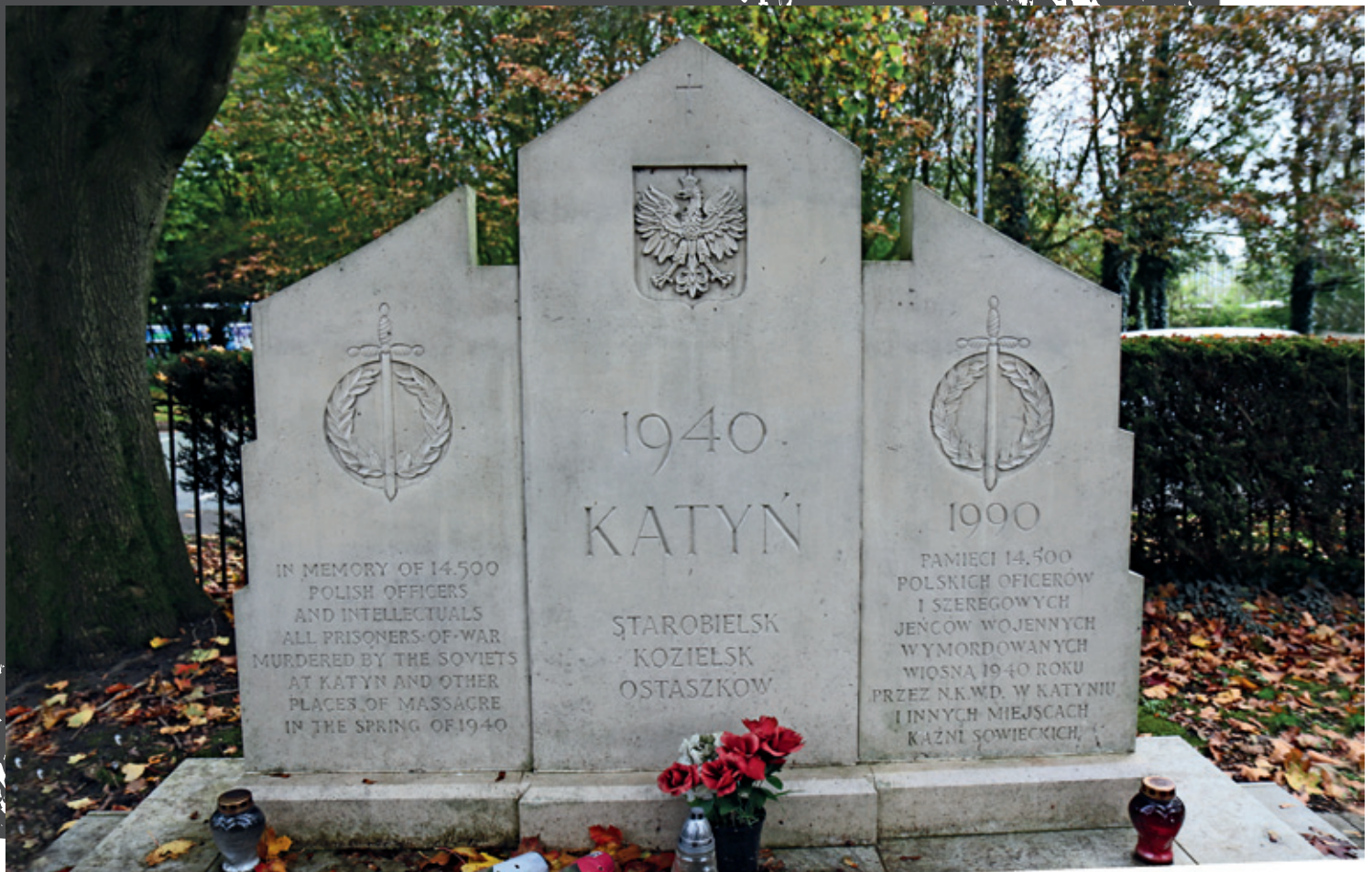
The Katyn Monument at Southern Cemetery in Manchester