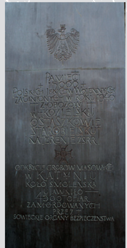
The Katyn Monument in Toronto