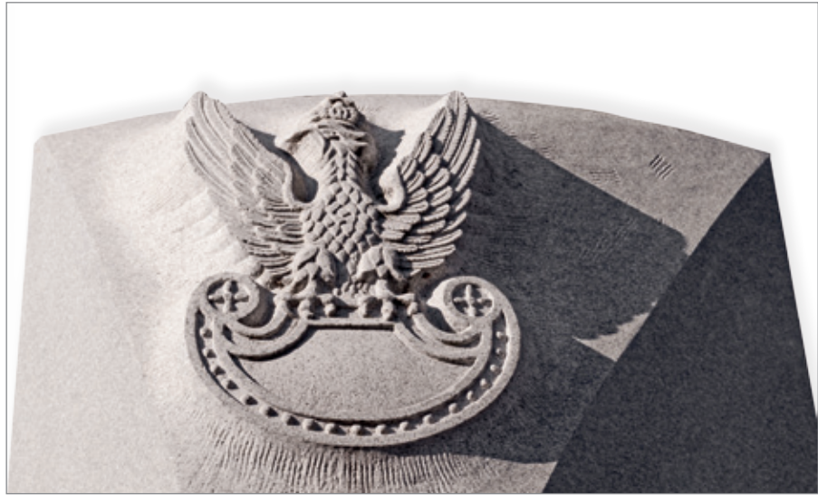
Polish War Cemetery in Kiev-Bykivnia