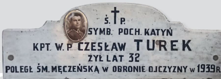
The grave of the Turek family in the parish cemetery in Pułtusk. The commemoration of Captain Czesław Turek (in 1939, cf.), buried in Kharkiv

of the communist usurpers' of power, provoked furious attacks by Soviet and other the communist diplomatic services and agencies.