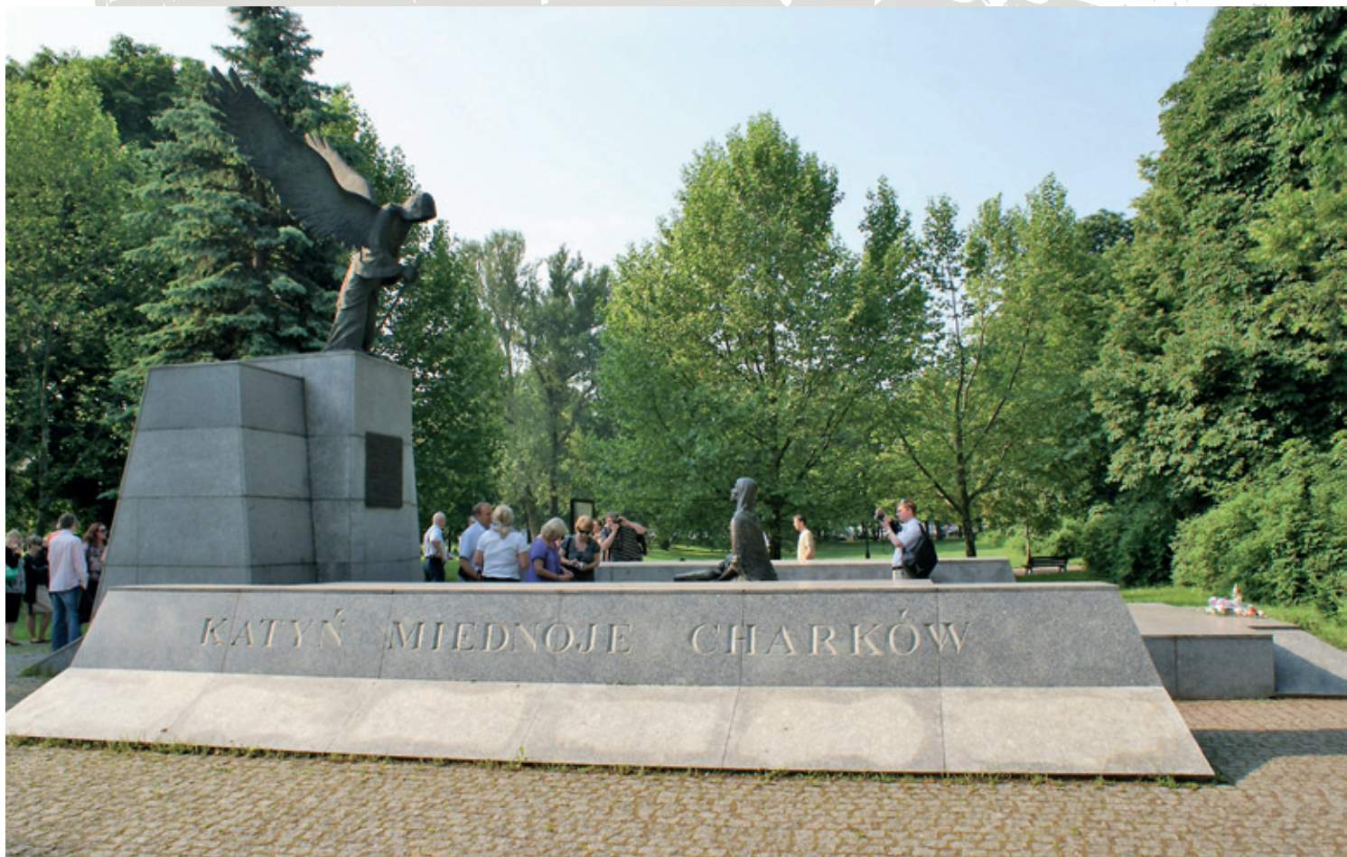
Monument to the Victims of the Katyń Massacre, Juliusz Słowacki Park in Wrocław