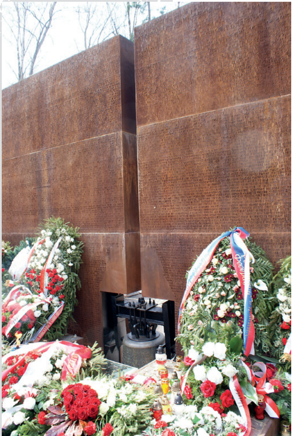
Polish War Cemetery in Katyń