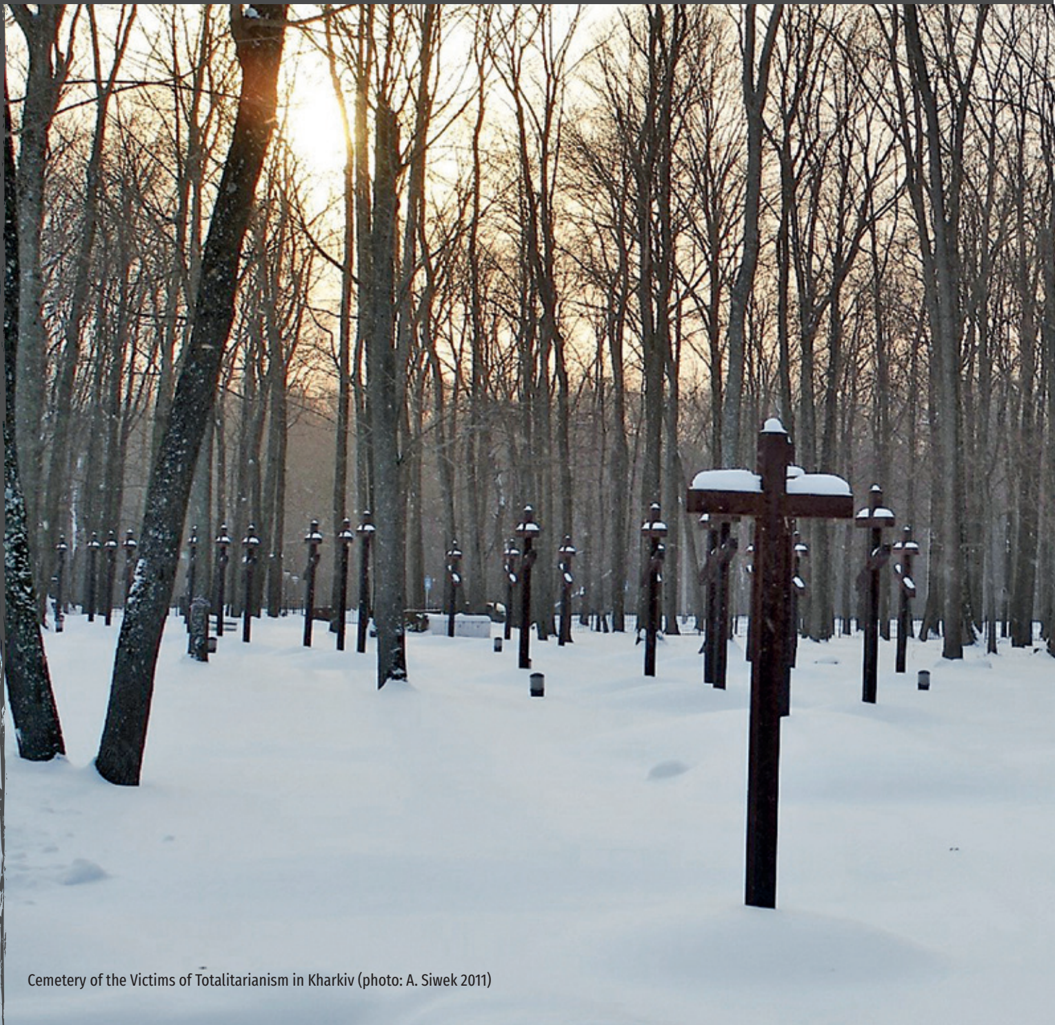
Cemetery of the Victims of Totalitarianism in Kharkiv