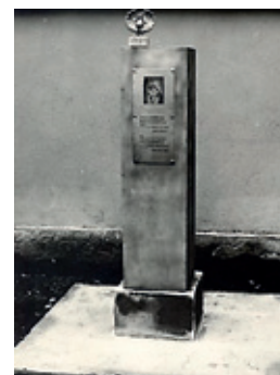
First Katyń Monument in Stockholm