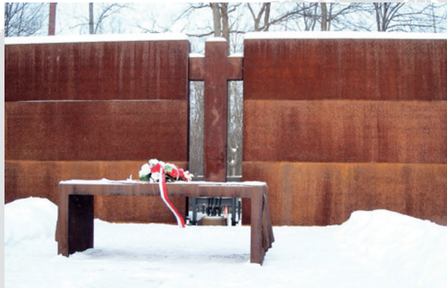
Cemetery of the Victims of Totalitarianism in Kharkiv

Between 1998 and 2012, four new cemeteries were constructed: in Kharkiv (consecrated on 17 June 2000), Katyń (28 July 2000), Mednoye (21 September 2000) and Bykivnia (2 September 2012). The first three were designed by the team: Zdzisław Pidek, Andrzej Sotyga, Wiesław and Jacek Synakiewicz – winners of the competition organized by the Council for the Protection of Struggle and Martyrdom. These cemeteries have common elements, made of cast iron or Corten steel: pylons – entrance columns with eagles, altars and altar walls covered with the names of those buried, a bell beneath the altar wall, individual epitaphs, and religious symbols of the main religions professed during the period of the Second Polish Republic.