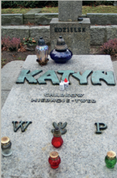
Little Katyń Valley at the Powązki Military Cemetery

Service. On 6 December 1981, the newly established Civic Committee for the Construction of the Monument to the Katyń Victims set up a temporary birch cross, during a ceremony which was attended by several thousand participants. The communist authorities removed this cross after martial law was imposed on 13 December 1981.