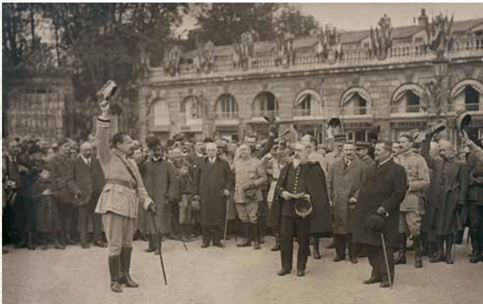
General Haller addressing the inhabitants of Nancy