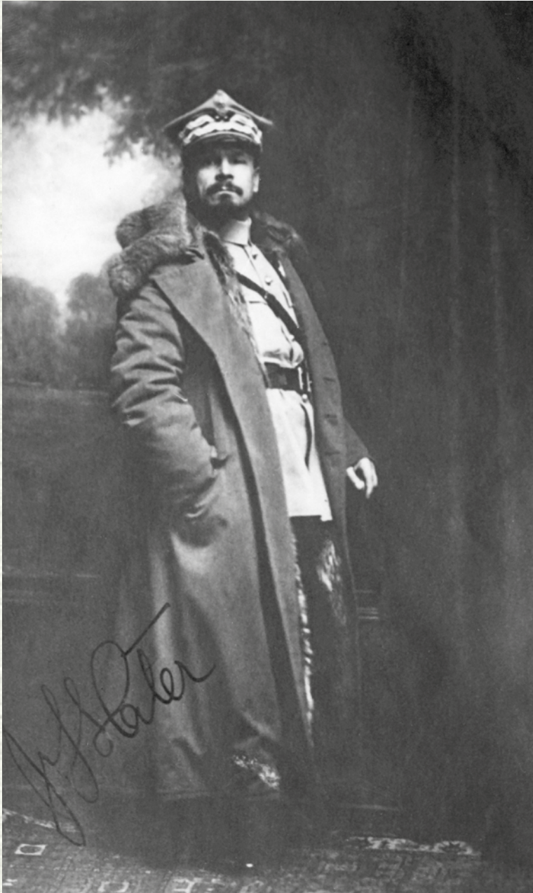
Józef Haller, Commander of the Second Brigade of the Polish Legions, Commander of the Polish Army in France