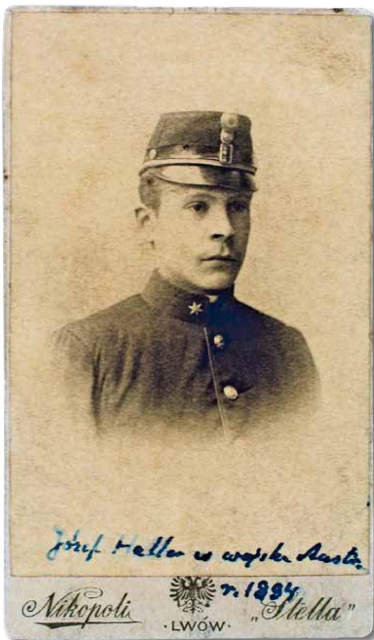
Artillery Lieutenant Józef Haller 1894