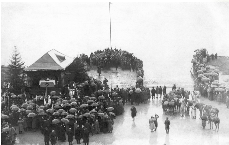
The ceremony of Poland's Wedding to the Sea took place during very unpleasant weather – it was raining and snowing – and it was cold. Puck, February 10, 1920