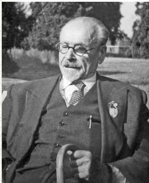
Józef Haller in London, 1955

hearts of veterans of the 3rd Infantry Regiment of the Polish Legions and the Blue Army. He also enjoyed great esteem among the people of the Pomeranian Province, whose lands he entered with the Pomeranian Front in January 1920.