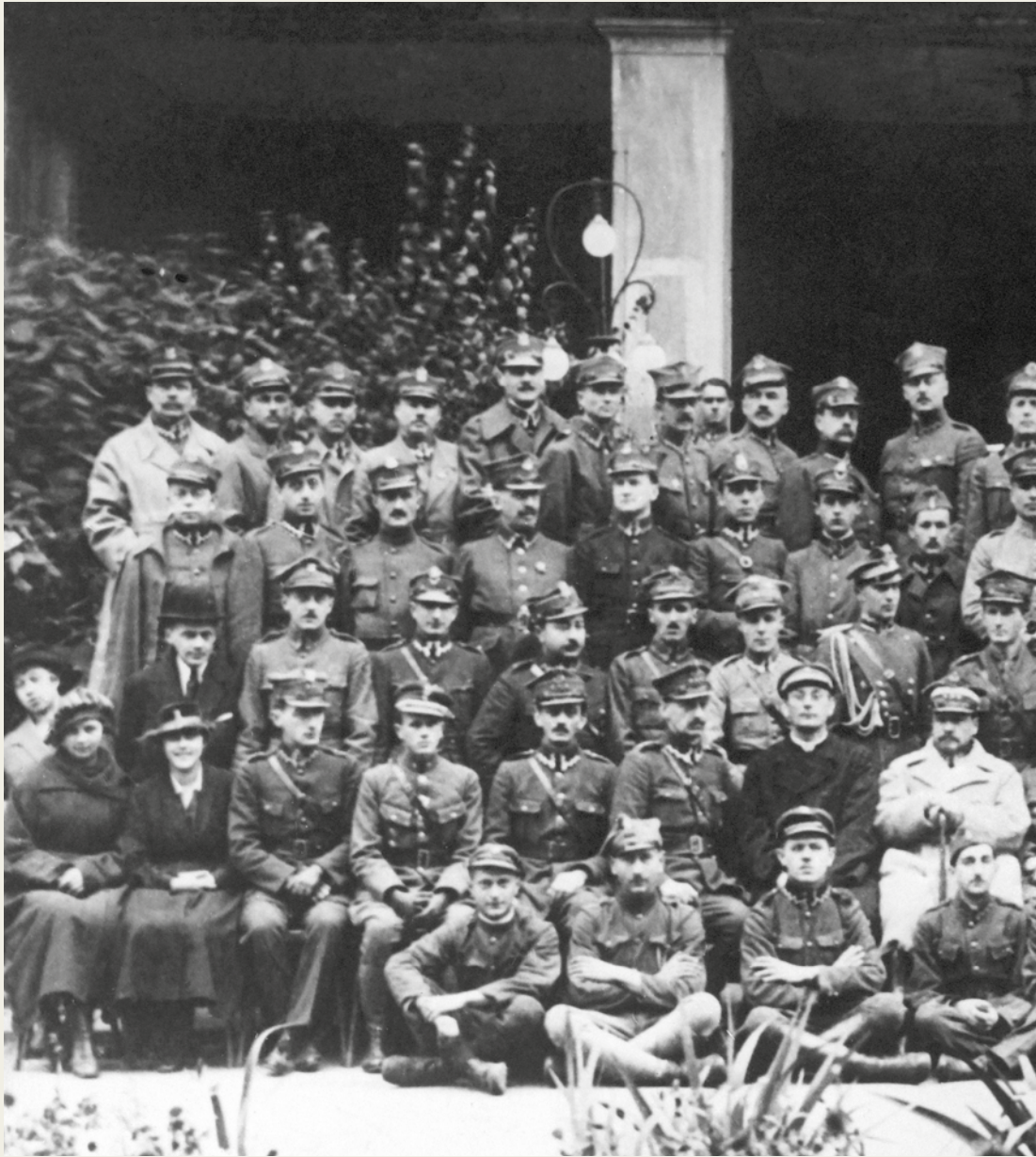
During the Polish-Bolshevik War, Haller was the General Inspector of the Volunteer Army. In the photo, he is surrounded by members of the General Inspectorate of the AO (in the second row, eighth from the left). Warsaw, 1920