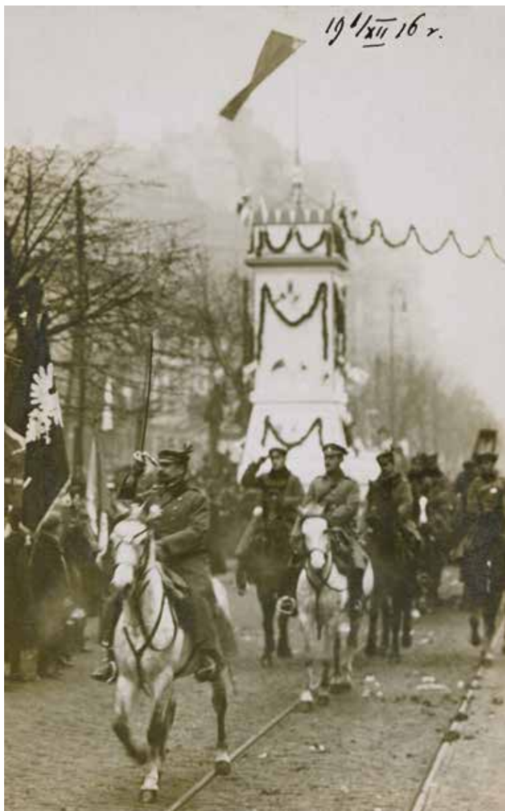
Welcoming Legionnaires led by Józef Haller in Warsaw, December 19, 1916