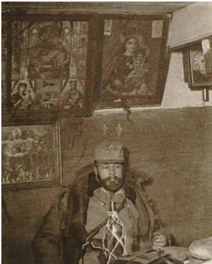
Colonel Józef Haller

In the spring of 1917, Governor General Hans Hartwig von Beseler began creating the Polish Armed Forces [Polnische Wehrmacht – PSZ], which was to include the Legions. However, Józef Piłsudski wanted them to be transformed into a Polish army and placed under Polish command. The creation of the PSZ was connected with taking a new oath