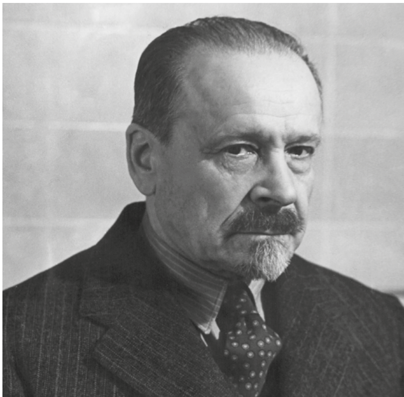
Józef Haller as a minister without portfolio, a photo taken in London during the Second World War

was hostile to Haller, led to his dismissal from all posts. From that moment until the end of the war, he was at the disposal of Władysław Raczkiewicz, President of the Republic of Poland, which involved only filling official representative functions during ceremonies and visiting wounded soldiers in hospitals.