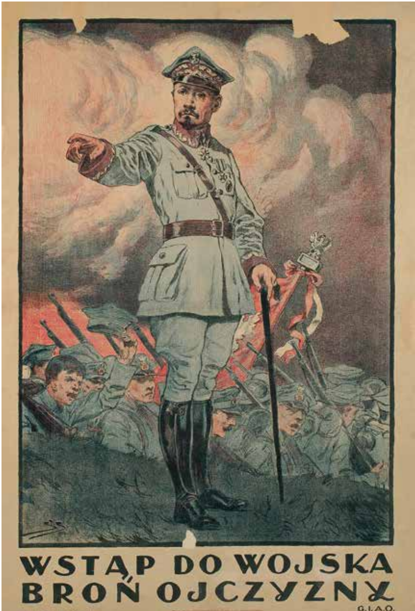
A propaganda poster from the time of the Polish-Bolshevik War: General Józef Haller calling for troops, 1920 (Poster Museum at Wilanów, Warsaw)