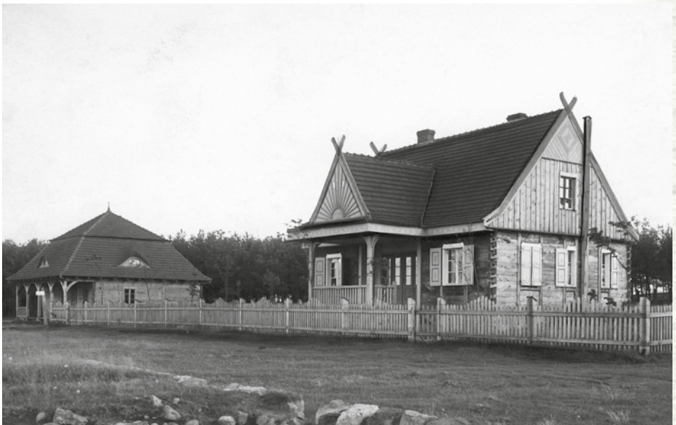
The General's summer house in the village of Hallerowo

From 1932 until the outbreak of WWII, the General and his wife lived in the Gorzuchowo estate, located in the then province of Pomerania. During this period, Haller focused mainly on meetings with Hallerians – not only in Pomerania but also on trips to other regions of Poland. He tried to spend summer months at his house by the sea in