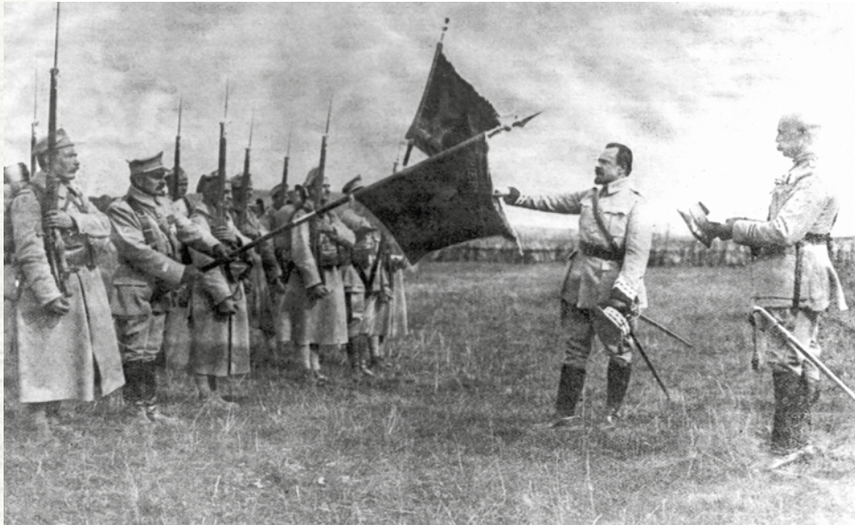
General Józef Haller assumed the Commander-in-Chief of the Polish Army in France on October 4, 1918