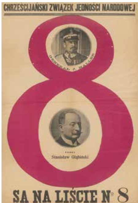
Electoral placard with a photo of among others, General Józef Haller, 1922

the demonstrations, organized by students, marched to General Haller's apartment. Haller himself gave a speech that intensified the atmosphere of hatred towards the newly elected head of state. When the assassination attempt occurred, the press began to accuse Haller of contributing to Narutowicz's death. These attacks led to a decline in public confidence in the legendary commander of the Blue Army, and PSL "Wyzwolenie" ["Liberation"] parliamentary deputy Marian Zyndram-Kościałkowski called the general a murderer. The politician refused to apologize and expressed his readiness to give satisfaction in a duel. Haller agreed but declared that he would not fire a shot. So it happened. Kościałkowski fired first and missed; Haller did not fire a shot. However, for his participation in the duel, he was expelled from the Marian Sodality (after a long struggle, however, Haller returned to it after four years' time). Then he resigned from the post of the President of the Supreme Scout