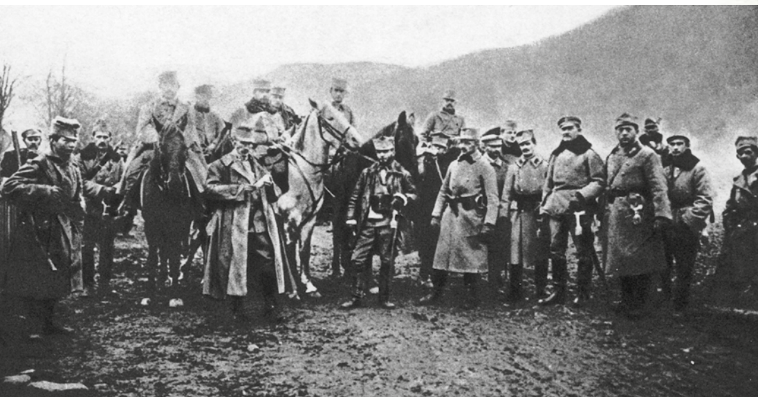
A group of officers, with Lt. Col. Józef Haller, mounted on a grey horse

The unit underwent its 'baptism of fire' in Hungary in the Eastern Carpathians. It was decided that despite insufficient equipment and proper training, the soldiers would be thrown into battle. The first clash with Russian troops took place near Rafajłowa. The Legionnaires took over the village, and the regiment's headquarters were set up there.