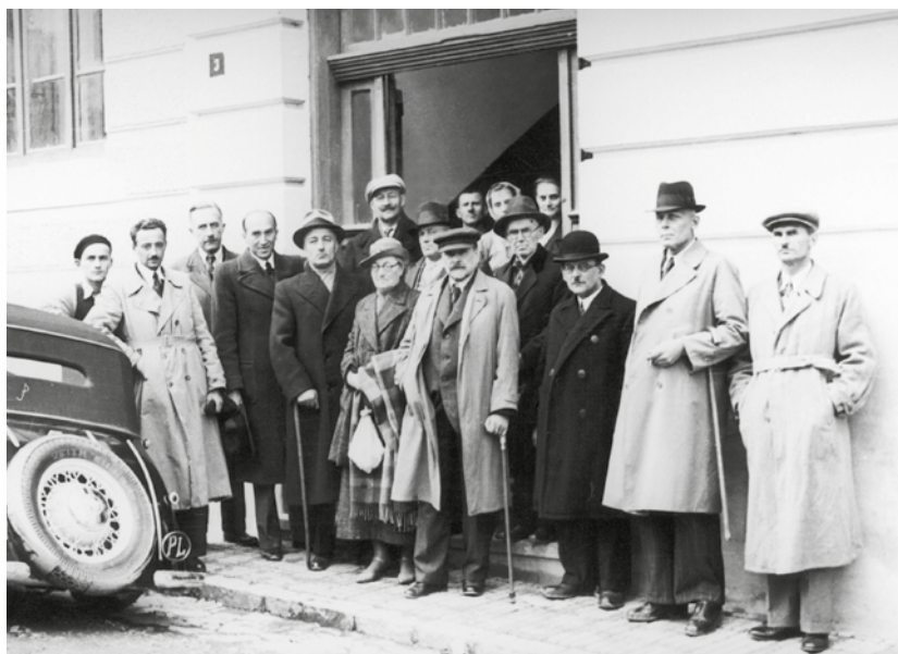
General Józef Haller and his wife among Polish refugees in Romania

In Paris, Haller was appointed to the government of General Władysław Sikorski as minister without portfolio and representative of the