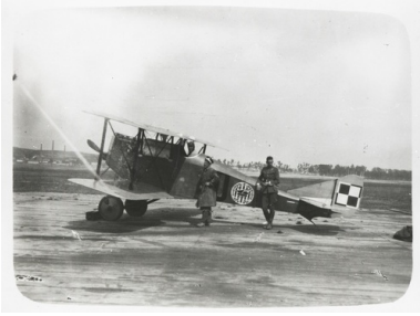
Ansaldo A.1 Balilla with side number 10 (serial no. 16739, no. CWL 16.4). Part of the 7th Air Escadrille since May, 1920. Photo from the Polish Air Force Museum in Cracow

On October 14th, the Americans showed up at Józef Piłsudski's doorstep. They were received rather coldly. The Chief of State compared his guests to mercenaries. He did not oppose their service, but he said the famous words Show me what you can do!