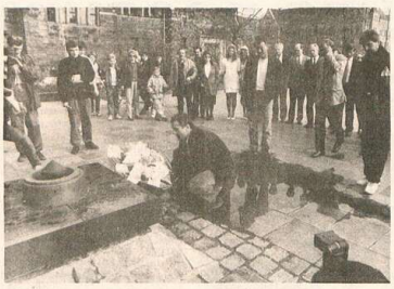
Przy pomniku „Poznańskiego Czerwca”.