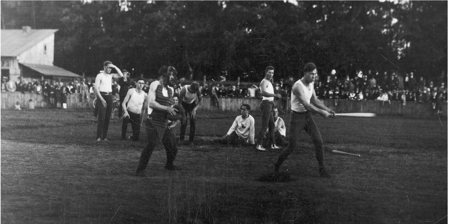
Members of the Polish Falcons' Alliance of America during a baseball show game at a field in Wisła, Cracow, 1925.