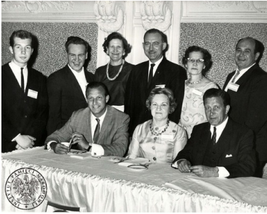
Stan Musial with members of the Falcons.