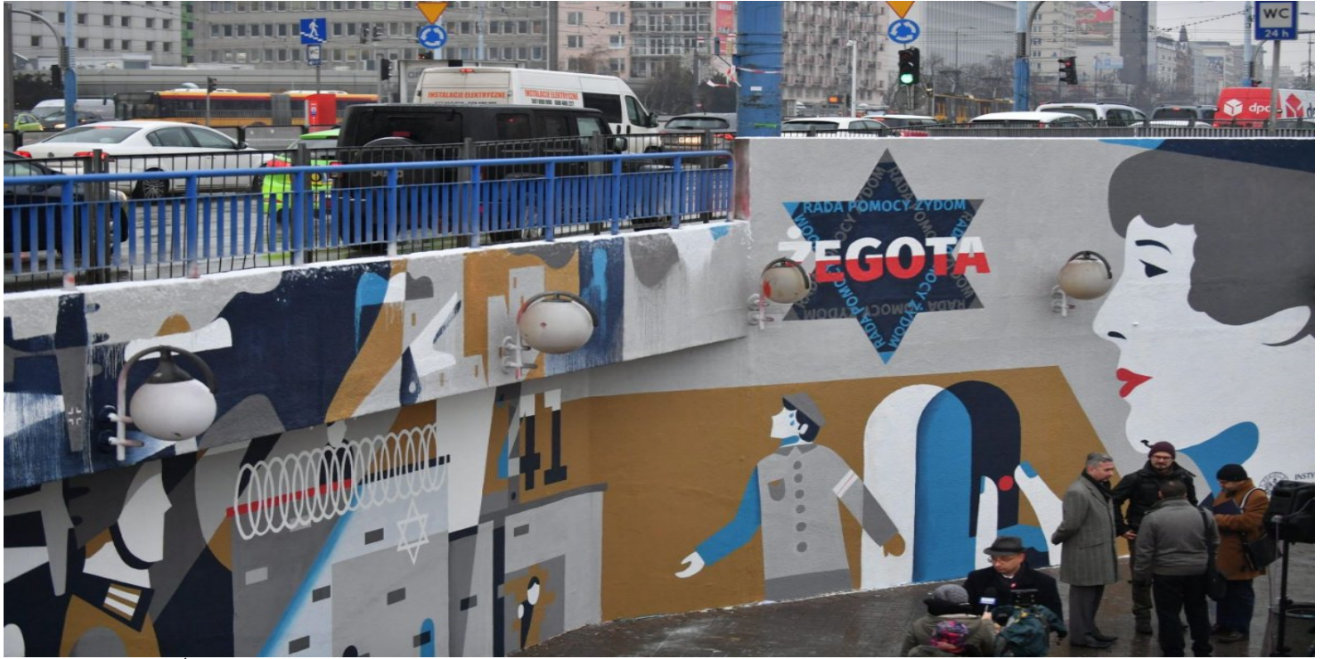
The Council to Aid Jews "Żegota"