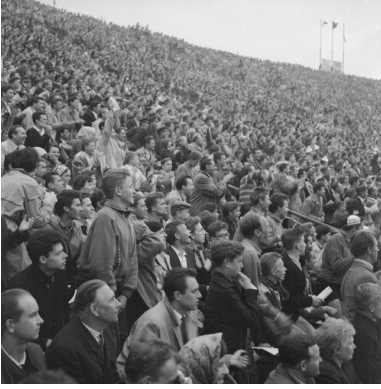
Peace Race: spectators at the 10th-Anniversary Stadium (Warsaw); 1961