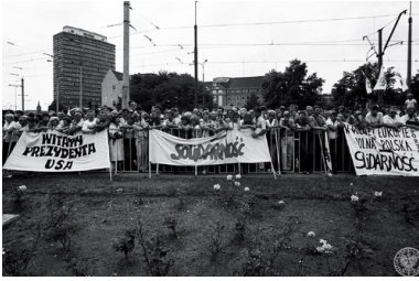
Citizens of Gdańsk waiting for the arrival of the presidential couple by the Monument for the Fallen Shipyard Workers. July 11th 1989