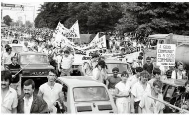
Anti-communist demonstration of the "Fighting Solidarity" during the visit of president George Bush in Gdańsk. Protests near the Podwale Grodzkie Street, in the back part of the skyscraper called "Zieleniak". July 11th 1989

He then met with prime minister Mieczysław Rakowski and the representatives of the American press. He ended his first day of the visit with a solemn dinner at the Palace of the Council of Ministers with Mr and Mrs