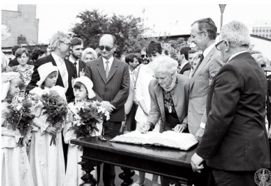
Ceremony of commemorative

The last part of the program was the visit of both leaders at Westerplatte. After that, the US president flew to Budapest.