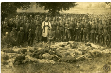
Bodies of Polish soldiers murdered and fallen near Leman at the cemetery in Kolno, August 1920

Soviet command respected the provisions of the capitulation agreement concluded on 10 January 1920. Only the families of soldiers remained free, and without any food supplies. Younger officers were locked in a prisoner of war camp while the older ones, from the rank of captain and up, were jailed.