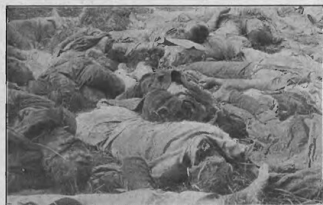
Więźni do niewoli, rozstrzelani i wycieczki szablami we wsi Lemanów ziemie łomżyńskiej pow. kolniejskiego: I okrutni p. p. 37 żołnierzy i 5 cywilnych z Bagnu Kowieńskiego p. p. dnia 25-go lipca 1920 roku. Dochowani zostali przez ludność m. Kołna.

Reproductions of pictures of soldiers fallen near Leman, published by the "Tygodnik Ilustrowany" issue no. 39 from 25 IX 1920