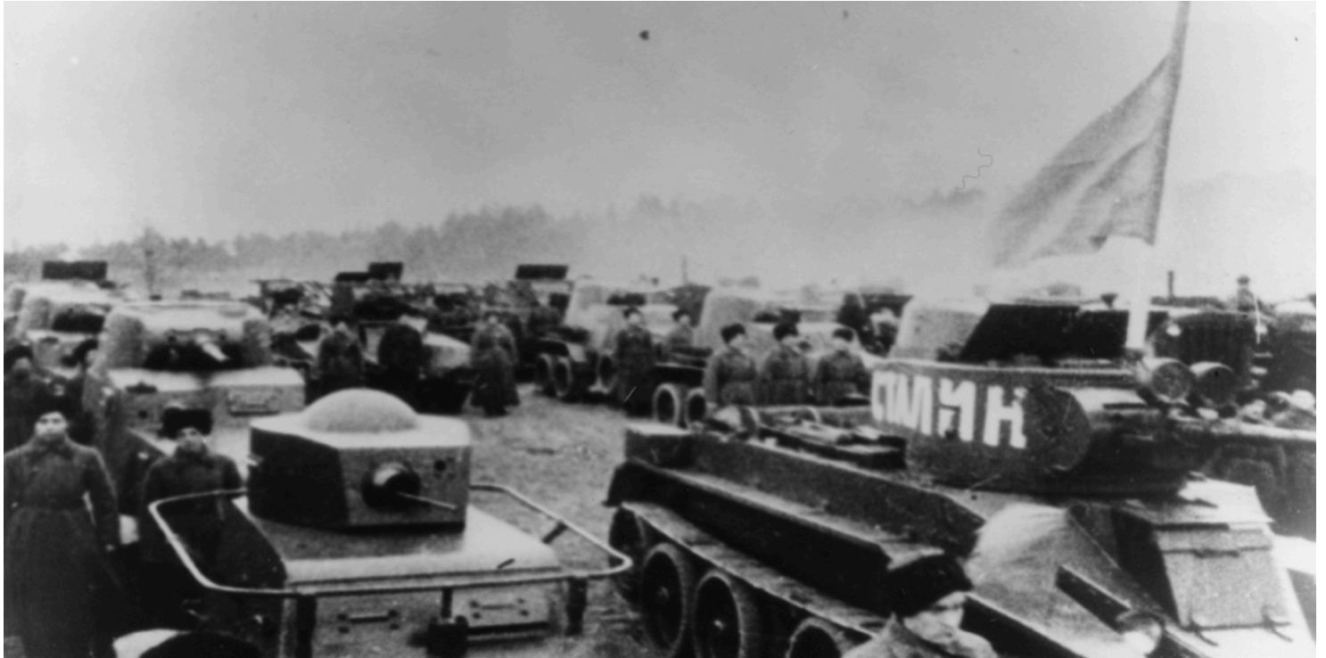
Red Army troops awaiting the beginning of a parade in Białystok, September 1939