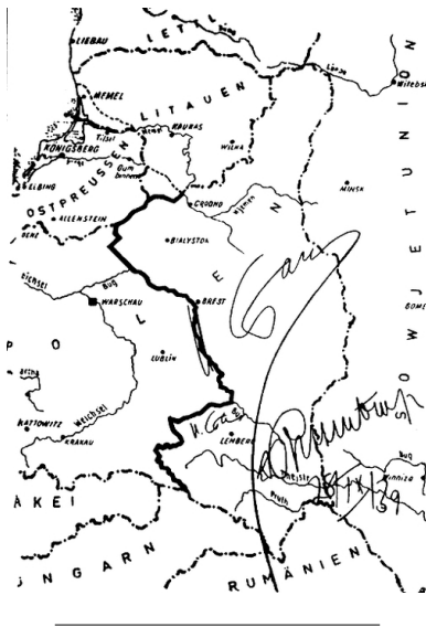
Map of the final division of Poland between the Third Reich and the Soviet Union from 28 IX 1939 with the marked border and original signatures of Joseph Stalin and Joachim von Ribbentrop

Lasting almost two years, the occupation of these territories by the USSR equalled ruthless terror for the Polish citizens. Among the means of repression used by the Soviets were arrests, deportations to gulags, the Katyń Massacre. The total toll of the Soviet occupation is not yet entirely known today. Historians estimate that only in September 1939 soldiers of the Red Army and members of the operational secret services Cheka murdered 2.5 thousand prisoners and several hundred civilians, while during the two years of occupation at least 800 thousand Polish citizens were sent deep into the USSR (this number includes both POWs, people sent to gulags, deportees, those mobilised to the Red Army, people who decided to work at the USSR or were evacuated with the front when war broke out between the two aggressors in June 1941).