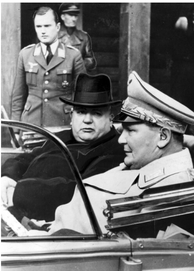
Berlin. Joseph Tiso's visit - 10.1940 The president of Reichstag of the Third Reich Hermann Goering (from the right) and president of Slovakia Joseph Tiso in a car.

General Čatloš, when delivering a speech to his soldiers on September 13 th , said: "Soldiers of the young Slovak army turned out to be worthy brothers in arms to their German friends, with whom they brought back peace and order to the territories stolen by the Polish radicals and terrorists" 15