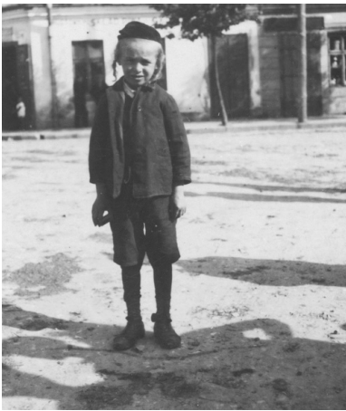
Jewish child on the streets of Rudnik in the inter-war period.