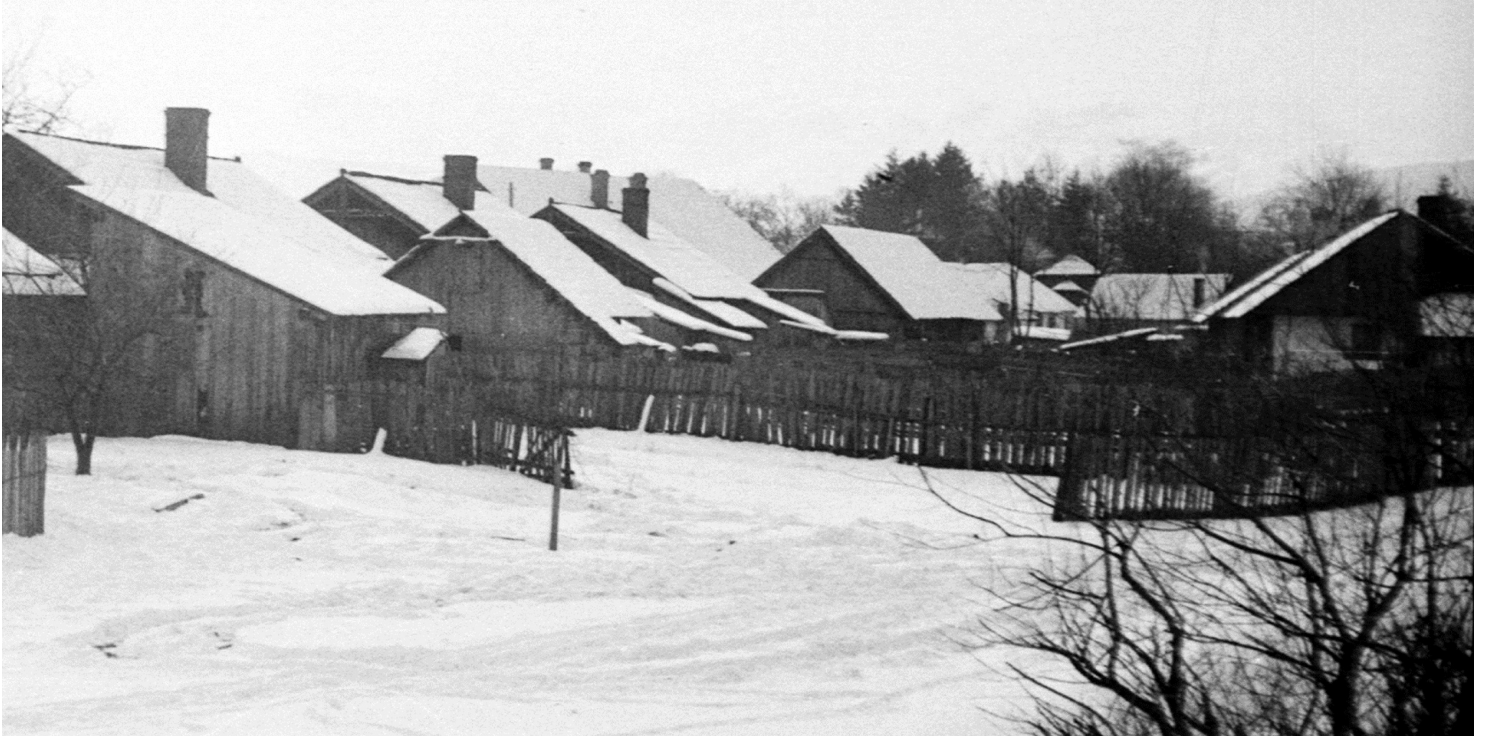
Village buildings in winter - scenery of the 1930s