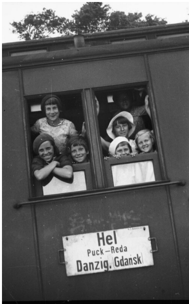
Children in a train connecting Gdynia to Hel, 1934