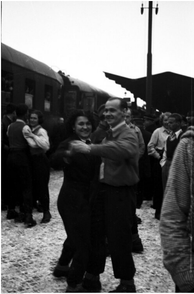
Trip train "Skis - Dancing - Bridge". Passengers are dancing on the station's platform, 1933