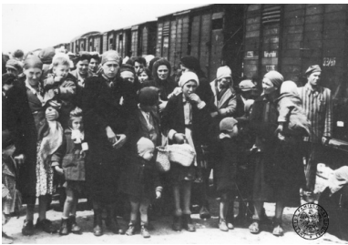
Women and children upon arriving at the KL Auschwitz-Birkenau camp, May 1944

war, part of their areas were usually given to Poles for management and were made into the places of memory. Thanks to that some camp buildings remained as well as objects left by prisoners, sometimes even documentation which the Germans were unable to destroy (although it needs to be mentioned that often the camps' infrastructure was taken away by the Soviets). Part of the territory of the Majdanek camp was put under special protection already in November 1944 as a place of memory, which was made official in 1947. The Auschwitz memorial was created the same year. In Treblinka, such a place was created much later - as far as in 1964, since the Germans eradicated and destroyed the camps themselves in 1943, following the uprising of the prisoners.