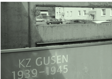
View through the wall of the Gusen camp