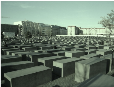
Memorial to the Murdered Jews of Europe

Currently, the knowledge on the subjects of the Second World War, its crimes, especially the Holocaust, is much larger in Germany than in Austria. However, it is largely selective, which is proved i.e. by the almost total omission of the Slavic victims. The difference in cultivating the memory of victims can also be observed in the approach towards the memorial sites like the former concentration and death camps.