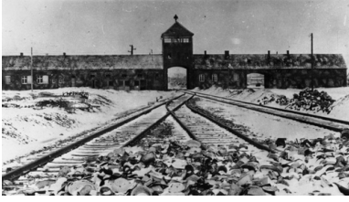
The KL Auschwitz gate, January 1945