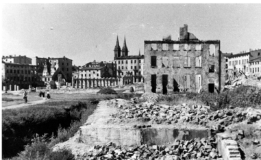
Ruins of the Łódź ghetto after the war had ended, 1945