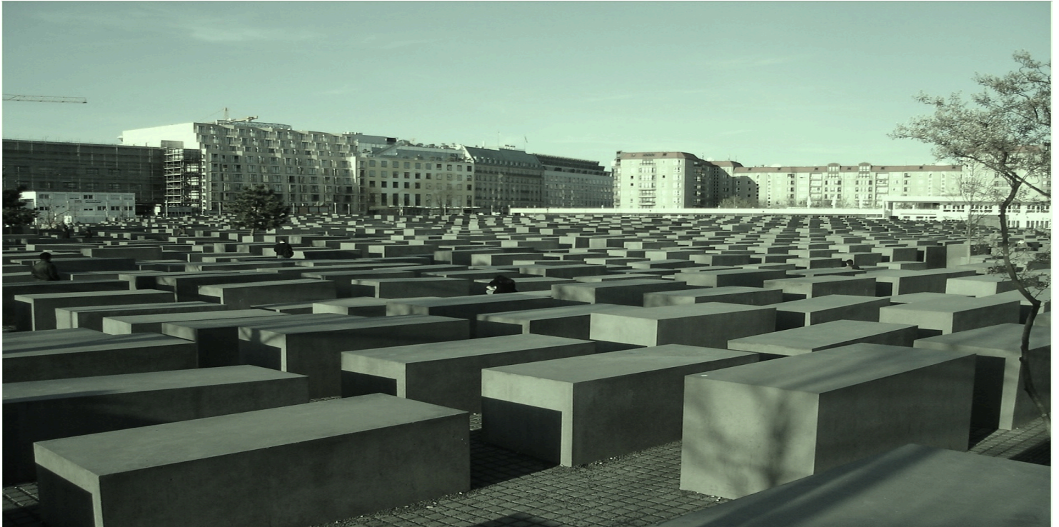
Memorial to the Murdered Jews of Europe