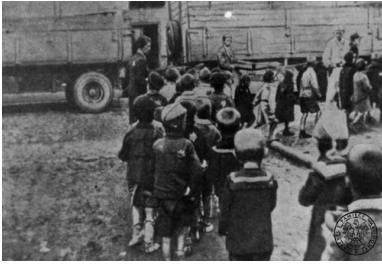
A group of small, Jewish children walking in pairs at one of Łódź's streets during a deportation to a death camp in Chełmno by the Ner river in the summer of 1942

The situation was slightly different at the territory of the German Democratic Republic, where there had previously been several, large concentration camps. When the camps were liberated by the Soviet troops, they unfortunately retained their functions, although under the NKVD's management. The Germans suspected of crimes, but mostly "the enemies of the people", were kept in Sachsenhausen, Ravensbrück and Buchenwald between 1945-1950. Only when East Germany was founded, some of the camp areas were given to the German authorities. Sadly, the former buildings were often very damaged and the local population used the post-camp infrastructure as a source of building materials. In Sachsenhausen, between 1952-1953, the Barracked People's Police (Kasernierte Volkspolizei – KVP) blew up the remains of the crematory, and built a shooting ground on part of the area.