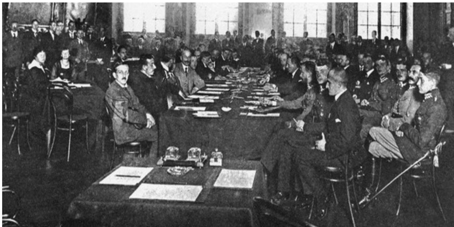
Podpisanie traktatu pomiędzy Polską, Rosją i Ukrainą