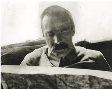
Józef Piłsudski over a staff map during the Battle of Warsaw (Public Domain)

A serious problem on both sides was the exchange of prisoners of war. The exact number of Polish POWs is not known - historians assume that there could have been between 44 to 60 thousand of them. The conditions in the Soviet camps were comparable to those in which Red Army soldiers were held on the territory of the Second Polish Republic. It is difficult to determine the number of deaths from diseases. By October 1921, nearly 26.5 thousand people returned to the country. Over 20,000 never crossed the border and with a high degree of probability it can be concluded that most of them did not survive captivity, were shot or died of exhaustion and starvation.