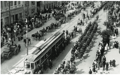
Polish Army entering Kiev, May 7th 1920

The situation of the Catholic Church in the USSR, definitely dominated by Poles, may be a reflection of their fate. In 1923, in the Soviet Union there were 1.65 million Catholics, 397 priests, and nearly 580 churches and chapels.