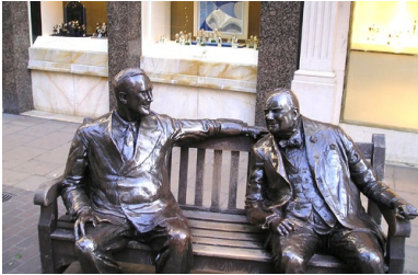
Public bench of Franklin Delano Roosevelt and Winston Churchill at the New Bond Street in London.

government-in-exile and the Soviet side, namely the aggression on September 17, 1939. There were the unsettled problems with the borders and the discovery in spring 1943 of the mass graves of Polish officers in Katyń, murdered by the NKVD in the year 1940. All these difficult matters were left on the sidelines of the negotiations between global powers in November 1943. It was established that the Polish borders would be “corrected” - in the east somewhere along the Curzon line, and in the west, at the expense of Germany, along the Oder river. The shape of the future Polish state was left unspecified in Tehran, similarly to its system or political landscape.