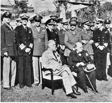
Franklin Roosevelt and Winston Churchill during the conference in Casablanca, January, 1943

The scales of victory were tilting towards the Allies and the time to establish a new world order after the war was coming. The Great Three was deciding on the shape and division of zones of influence: Stalin, Churchill and Roosevelt. In the years 1943-1945 they met twice like this (for the third time, following his death, Roosevelt was replaced by the new US president, Harry Truman). Their decisions not only sealed the fate of the lost parties, but also other, weaker allies, such as Poland.