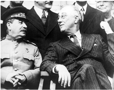
Joseph Stalin and Franklin Delano Roosevelt at the Tehran conference, November, 1943

Stalin, knowing his partners' intentions, skillfully formented disputes between Churchill and Roosevelt. While seriously negotiating, he often discretely mocked the British prime minister, at the same time constantly praising the American president. He gained so much sympathy with Roosevelt that in private conversations after the conference the American leader called him “uncle Joe”.