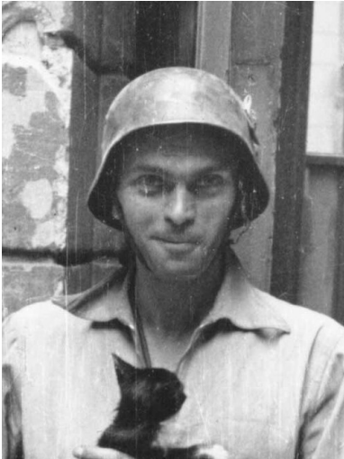
Second Lieutenant Eugeniusz Lokajski "Brok" standing with a kitten in front of the old Insurance Association "Russia", on Marszałkowska 124/128 (fragment), public domain

Lokajski's photographs are an invaluable source of information on the people and events of that time; they are also often the only evidence of these persons' presence in Warsaw during the uprising. The photograph of Lokajski himself with a kitten, taken with his own camera; the picture of Różyczka Goździejewska, the youngest nurse, and many other materials are an important historical source.